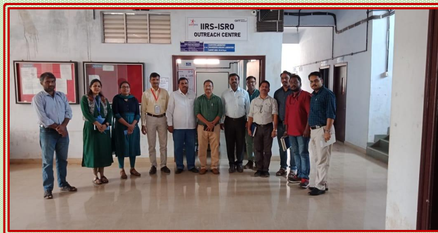
Faculty of Civil Department at Outreach Centre for Indian Institute of Remote Sensing of ISRO

The report as follows depicts various achievements of our department which certainly are in confirmation with our Institute's vision and mission. At our department, as rightly said by Winston Churchill, "We shape our buildings, thereafter they shape us" .