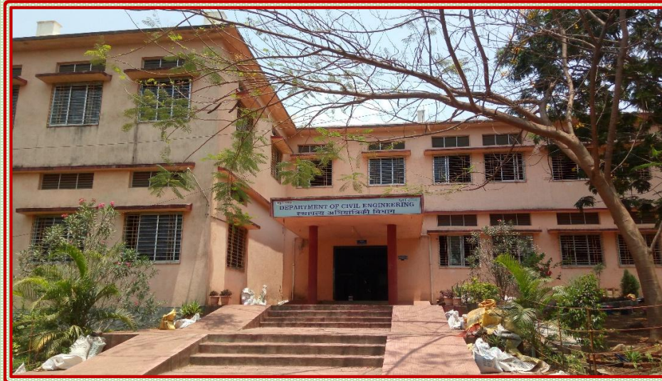
Front view of Civil Engineering Department, GIT (Lavel)

The report as follows depicts various achievements of our department which certainly are in confirmation with our Institute's vision and mission. At our department, as rightly said by Winston Churchill, "We shape our buildings, thereafter they shape us" .