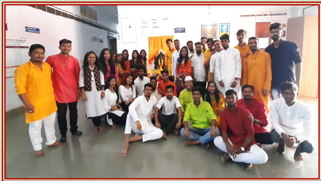
Shiv Murti Sthapana

It is the Students' Association of Civil Engineering students which is based on the main objective of promoting professional awareness among civil engineering students by encouraging a sense of unity and integrity through the combined efforts of all engineers working together in both technical and social activities.